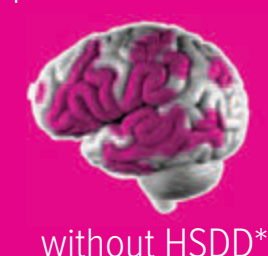
*Rendering of brain PET scans

"I hadn't had a sexual thought in what felt like months..."